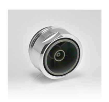
M24 MALE THREAD: ACTUAL SIZE

Choose your size carefully from the ACTUAL SIZE photo and description below: