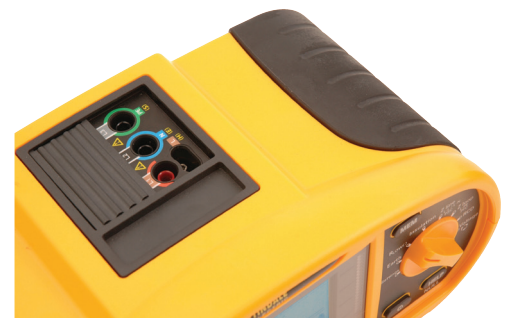
4mm sockets for standard Martindale lead sets. USB for downloading.