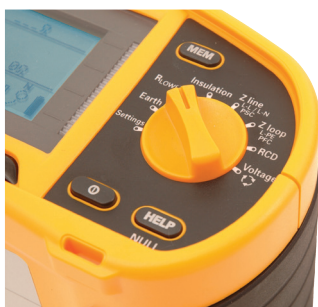
Easy selection of tests and on-screen help

The new ET4000 and ET4500 multifunction testers simplify 17th edition testing by having the latest amendment 3 fuse tables for Zs values built-in together with red and green LED indicators for instant pass/fail confirmation.