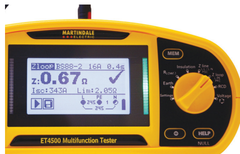
Pass/fail testing to the latest third amendment values